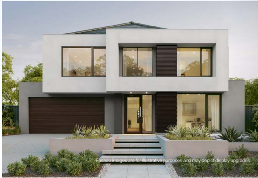
Facade images are for illustrative purposes and may depict display upgrades.

Whether you're looking for your first home, upgrading, or creating your forever home, Riverfield brings together the best builders and the latest designs, all in one place. There's no better time to visit and be inspired!